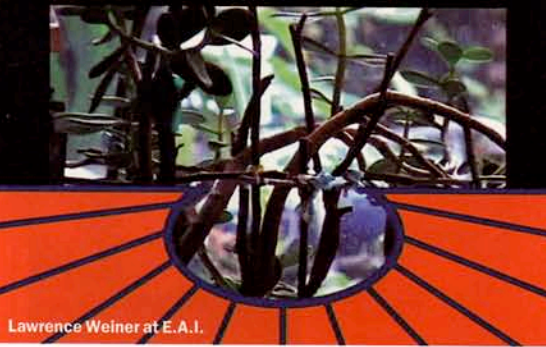
Lawrence Weiner at E.A.I.